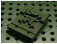
Build "green" part