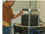
Place into oven to debind and infiltrate