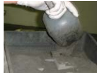
Cover "green" part and bronze infiltrant with alumina powder