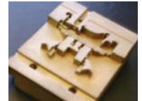
Post-finish, as necessary