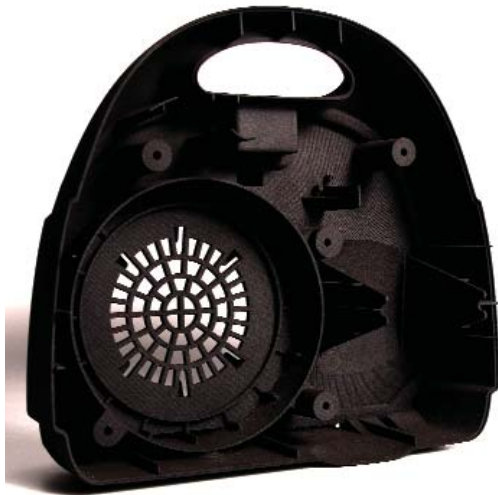
One-part, black powder contributes to uniform black color.